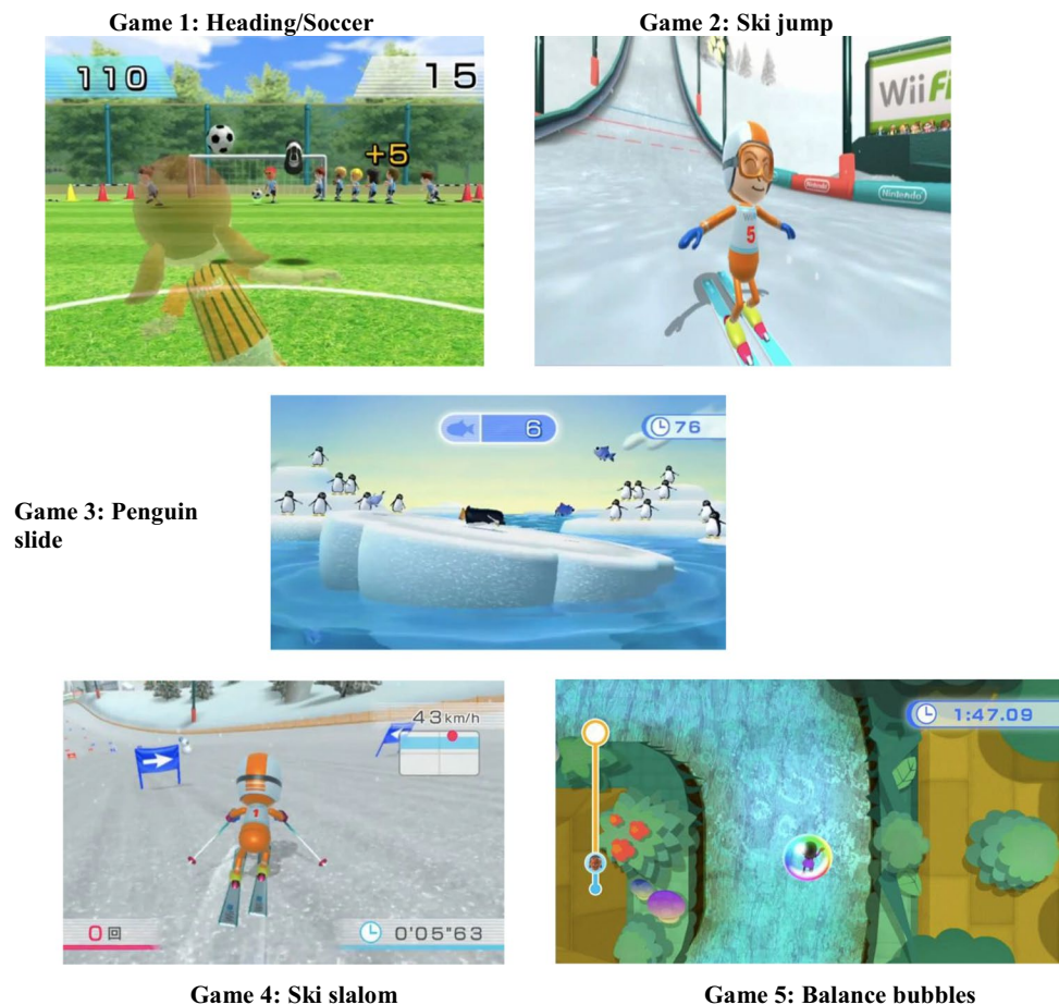
Fig. 1 Nintendo® Wii™ bal- ance games

Balance impairments of PBTS was evaluated using the Nintendo® (Kyoto, Japan) Wii™ Fit Plus Console Balance tests and Timed Up and Go (TUG) Test. In the literature,